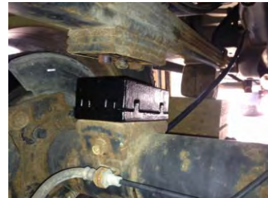
2.0" REAR LIFT OPTION