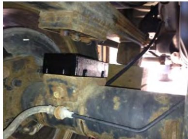
1.5" REAR LIFT OPTION