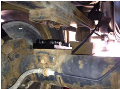
1.0" REAR LIFT OPTION

Step 7: Determine whether you want a 1.0", 1.5" or 2.0" rear lift, and orient the components according to the images shown below to achieve your desired right height. If installing in the 2.0" configuration, be sure that the indicia stamped FRONT on BOTH interlocking blocks is positioned toward the FRONT of the vehicle. (Figure E, below)