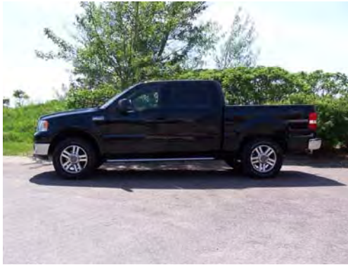
Vehicle BEFORE Installation