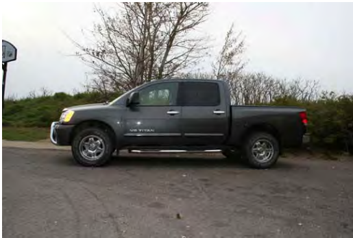
Vehicle BEFORE Installation