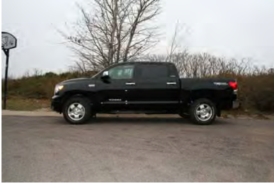
Vehicle BEFORE Installation