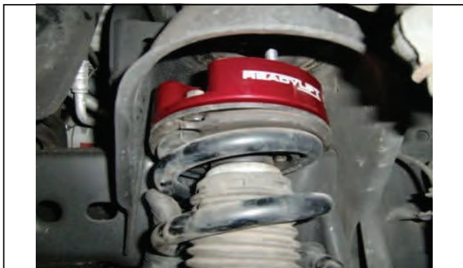
Reattach in vehicle with provided hardware and tighten

Repeat these steps on the opposite side of the vehicle. Reattach ABS/brake line brackets and tighten upper/ lower coil-over mount hardware to factory specs. When completed reattach the sway bar endlinks on both sides of the vehicle simultaneously. Reinstall wheels/tires on vehicle, lower to the ground and torque to factory specs. Alignment is to be performed.