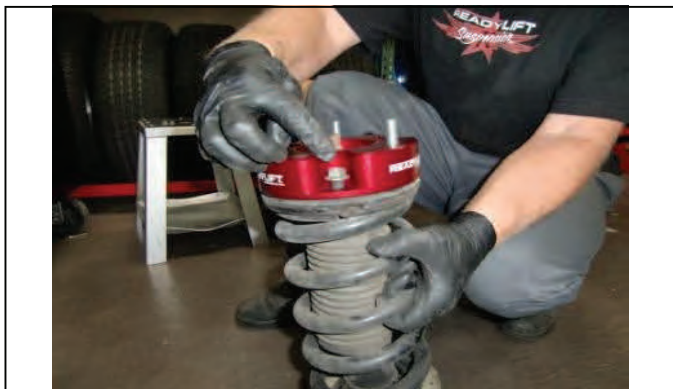
Strut assembly will be rotated 180 degrees for re-installation