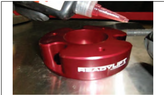
Note: Use thread locker to install studs in spacer