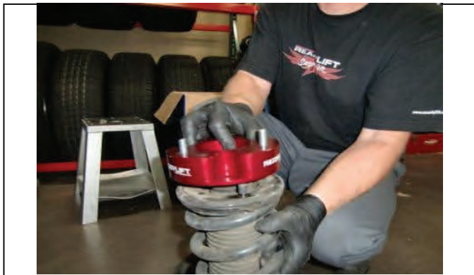
Attach spacer to top of strut with OE nuts and tighten