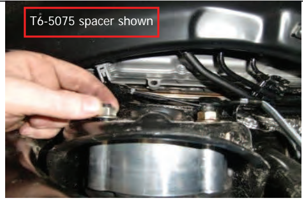
Reattach upper strut mount with provided nuts and tighten