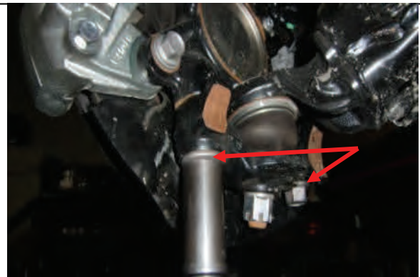
Remove (2) lower ball joint mounting bolts