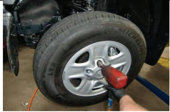
Remove front wheels/tires