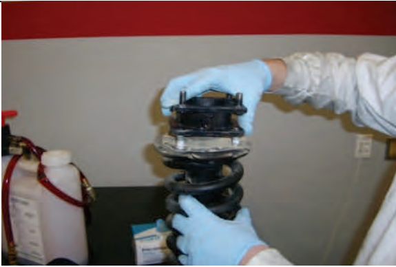
Attach strut extension spacer with OE mounting hardware