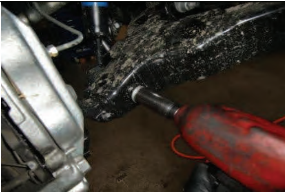
Reattach and tighten lower strut mounting hardware