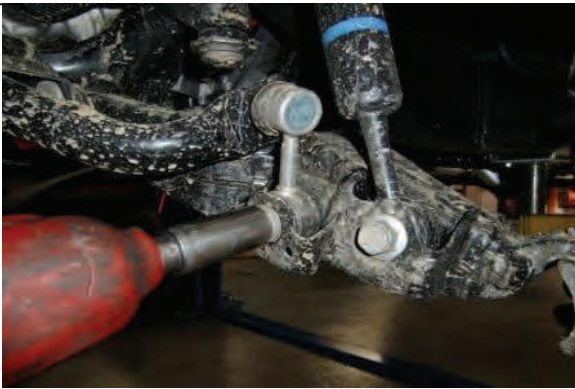
Reinstall wheels/tires, lower vehicle, reattach sway bar ends

**Tighten lower control arm bolts check all work, test drive and have vehicle aligned 4WD models only: Remove front skid plate from vehicle. Next, place a jack/support under front differential. Remove the (2) front differential mounting bolts. Lower the differential enough to allow installation of the (2) 1" spacers between the frame and the mounts. Install the provided longer bolts and nuts w/ the OE washers. Torque to factory spec. Then reinstall the factory skid plate with the provided 1/2" tall spacers and longer bolts in the front mounting locations. See photos below.