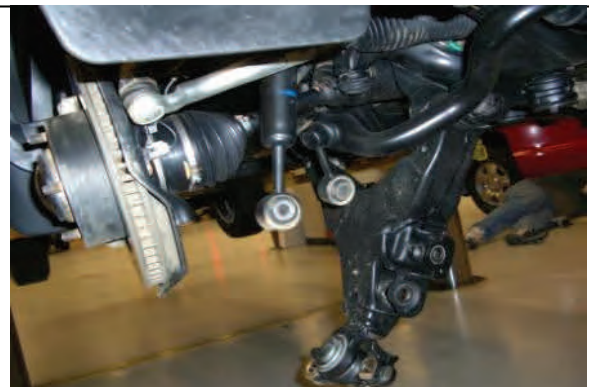
Swing down lower control arm and remove strut