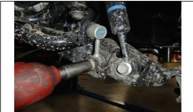
Disconnect lower sway bar end links