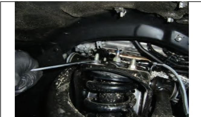
Remove upper strut mounting hardware