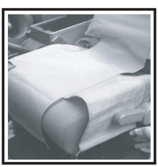
ch and straps should not effect seat

9. Pull sides around seat base and attach retainer hooks to suitable points under seat base.