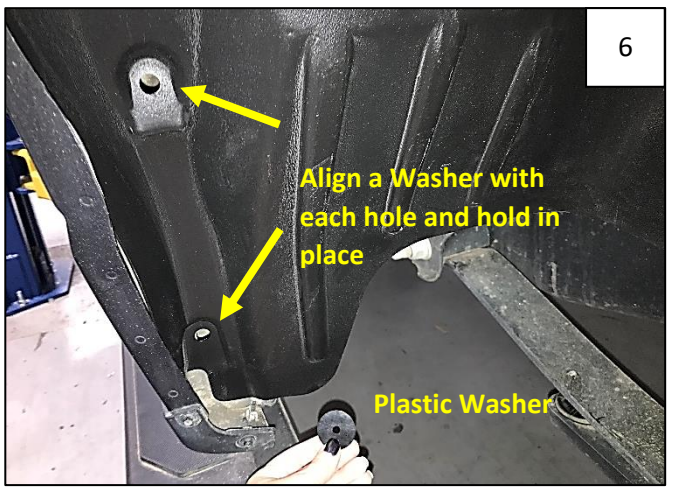
In one of two holes at front of wheel well, reach behind sheet metal and hold a supplied plastic washer behind factory hole in sheet metal (aligned with hole in wheel well liner).