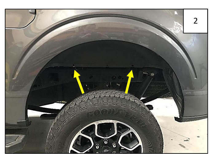
"U" Clip locations.

NOTE: Factory liner must be removed prior to installation.