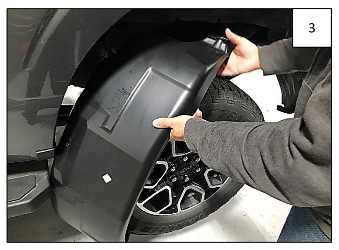
Slide the Rear Wheel Well Liner behind wheel at rear of vehicle. It is helpful to tilt the liner at a 45-degree angle at front of wheel and then straighten it out once it's behind the wheel.