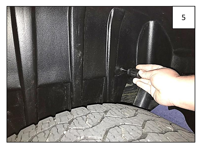
Start a supplied Truss Head Screw through each hole in back of wheel well liner and into clips installed in Step 1. Tighten both screws.

Tuck Rear Wheel Well Liner behind sheet metal at lower edges, and under metal fender lip at all other outward facing edges.