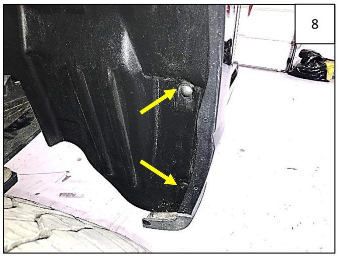
At rear of wheel well, repeat Steps 6-7 for two holes shown in photo.

While holding Plastic Washer at inside of sheet metal, insert a supplied Plastic Retainer through hole in wheel well liner, factory hole in sheet metal, and into Plastic Washer. Repeat Steps 6 and 7 for upper hole at front of wheel well.