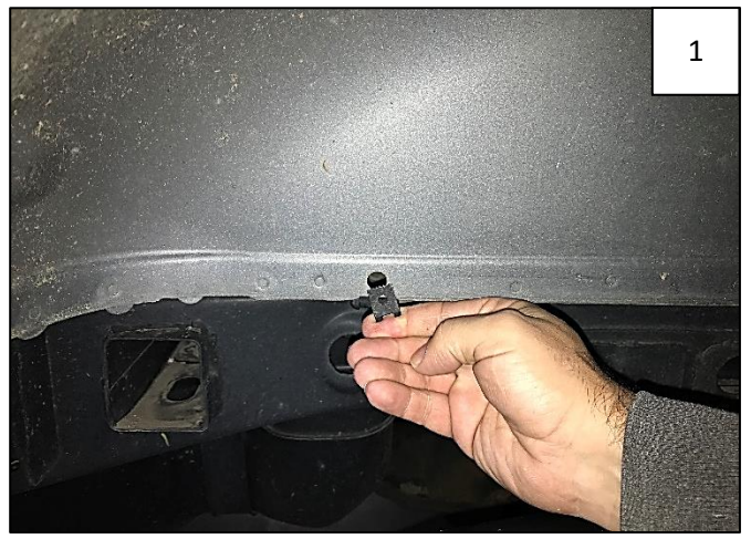
Install 2 supplied "U" Clips over factory holes at back of rear wheel well, as indicated in next step. Flat side of clip will face out when clip is installed.

NOTE: Factory liner must be removed prior to installation.