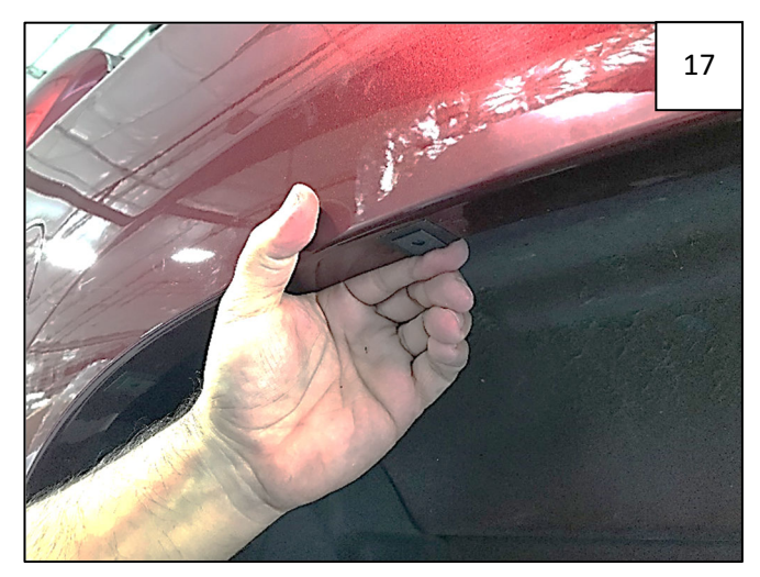
Slide a supplied "U" Clip over each Mounting Tab, centering over holes made in Step 16 (3 places).