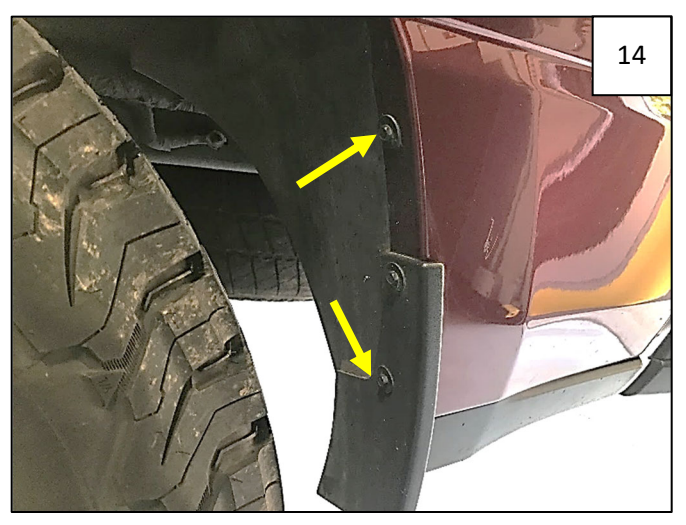
Using an 8mm socket, remove and retain 1 factory screw at center of rear mud flap. The mud flap will remain on the vehicle; do not remove any other mud flap fastener.