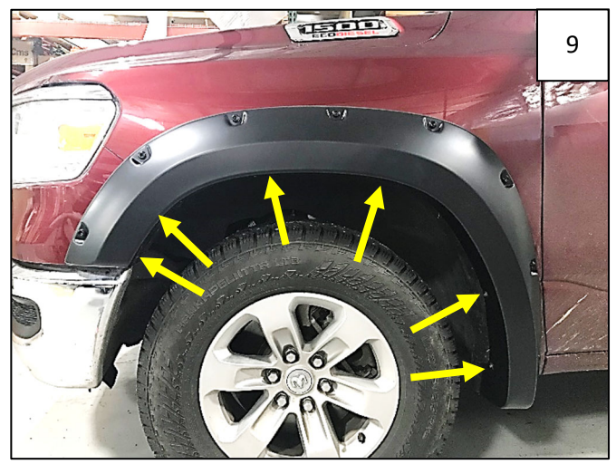
Align flare with vehicle. Start 6 factory screws through holes in flare and into factory holes.