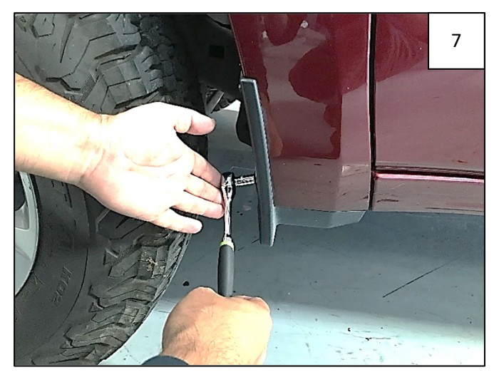
Remove 1 factory screw from center of mud flap. The mudflap will remain on the vehicle – do not remove the other fasteners.