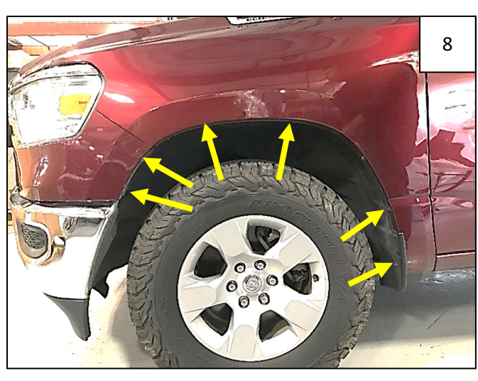
Hold flare to vehicle to note locations of screws to be removed. Remove and retain 6 factory screws from corresponding locations as shown.