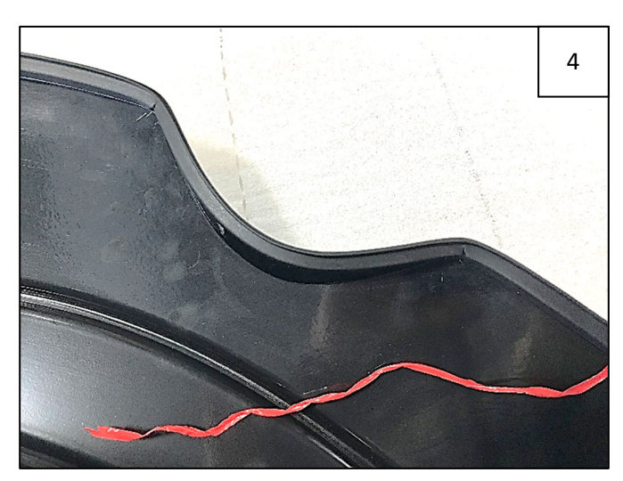
Correctly-installed edge trim around gas door.