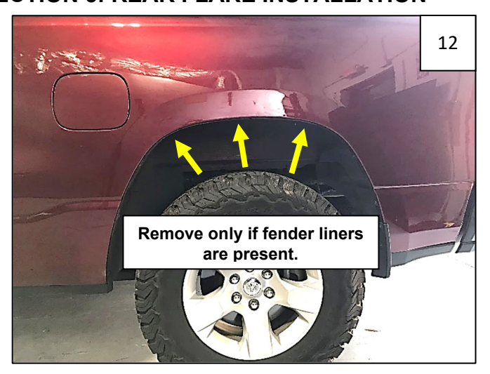
If vehicle is equipped with fender liners, remove 3 factory screws at top of fender. If vehicle is not equipped with fender liners, proceed to Step 13.