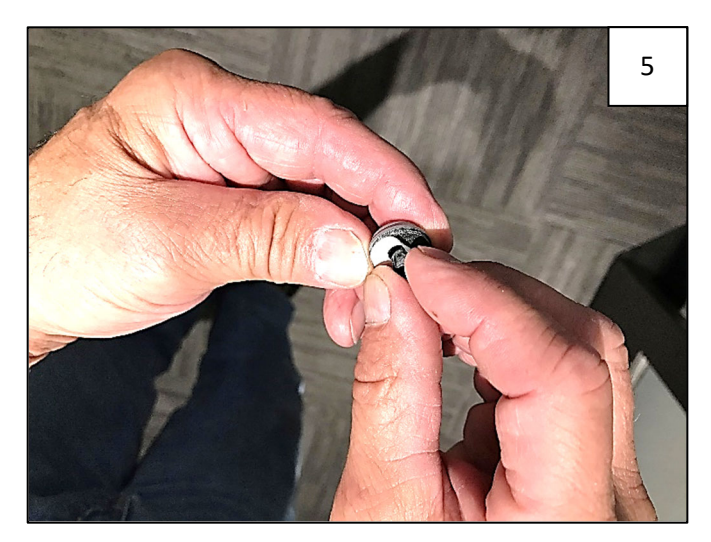
Peel liner from tape on Push-In Pocket Hardware (brushed metal or black as preferred). NOTE: There will be extra Push-In Pocket Hardware.