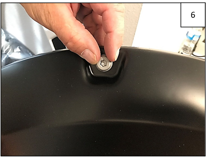
Insert Push-In Pocket Hardware into each flare pocket hole (on outer flare surface, 8 places each front flare, 9 places each rear flare). Push in to engage clip and tape adhesion.