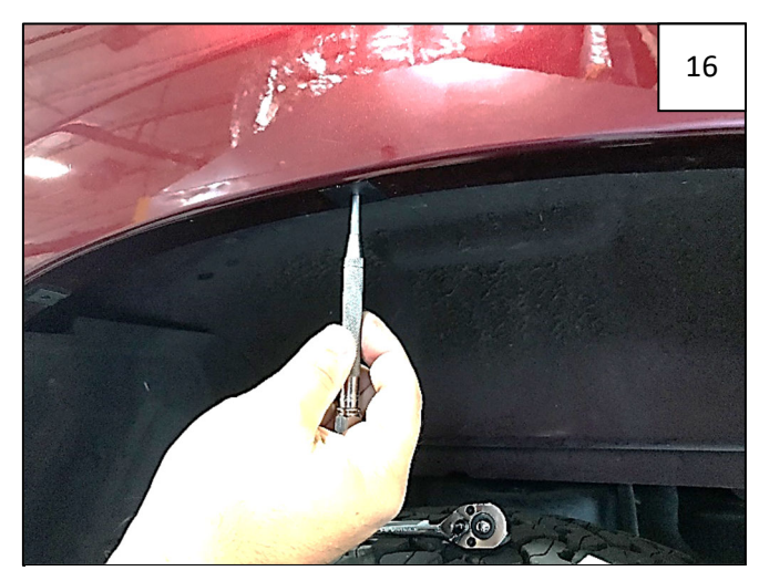
Using an awl, pierce Mounting Tabs installed in Step 15 and into factory holes underneath.