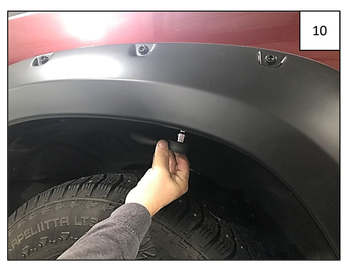
Apply pressure to flare towards vehicle body at each fastening point and tighten all fasteners.