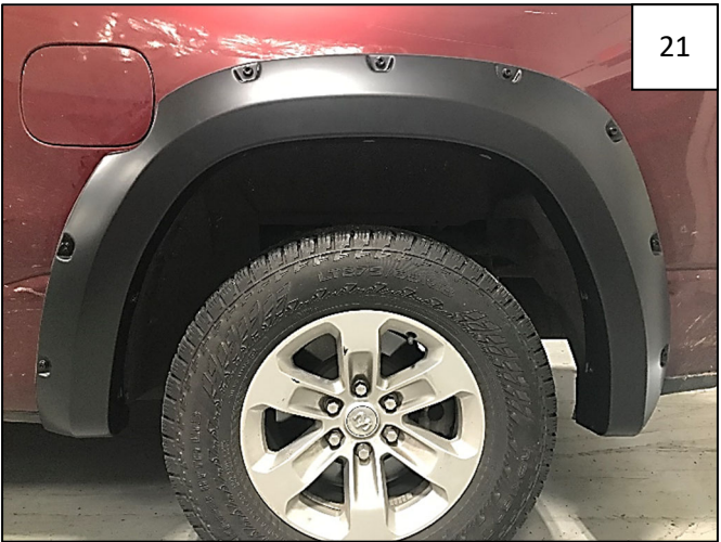
Complete Rear Flare Installation.