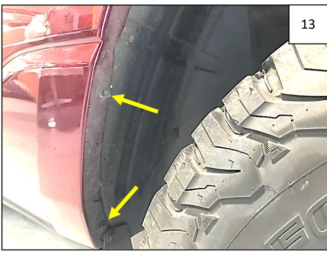
Using an 8mm socket, remove and retain 2 factory screws at front of rear wheel well.