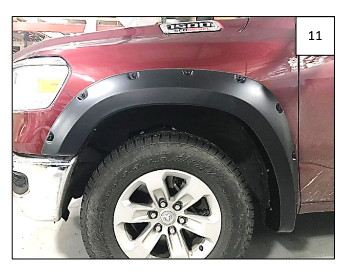
Complete Front Flare Installation.