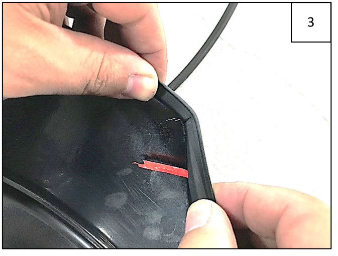
As you come to the second "point" in the flare, make another "V" notch in the backside of the edge trim, retaining 2-3 inches of vinyl backing. Proceed along the rest of the flare.