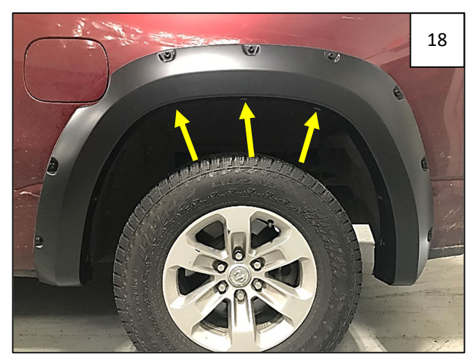
Align flare on fender. Using a Phillips screwdriver, start 3 supplied Truss Head Screws through flare and into clips installed in Step 17.