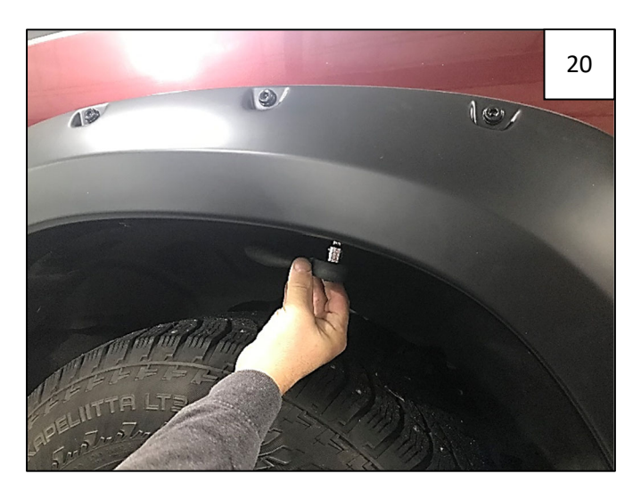
Apply pressure to flare towards vehicle body at each fastening point and tighten all fasteners.