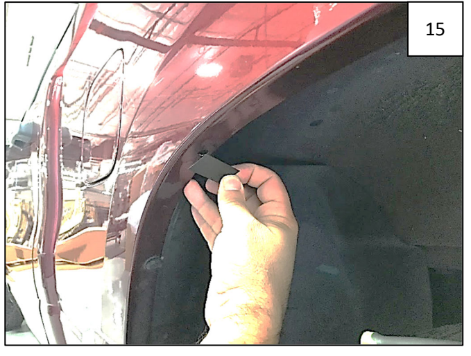
For 3 topmost holes in wheel well, peel liner from a supplied Mounting Tab and center over each factory hole (3 places).