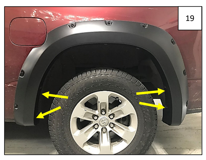
Install 4 retained factory screws through remaining holes in flare and into factory holes in fender.