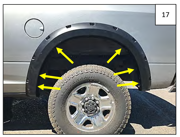
Install 6 retained factory screws through remaining holes in flare and into factory holes in fender.