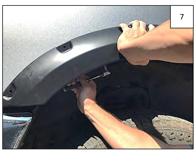
Press inward on flare to apply pressure to the flare and tighten all screws.