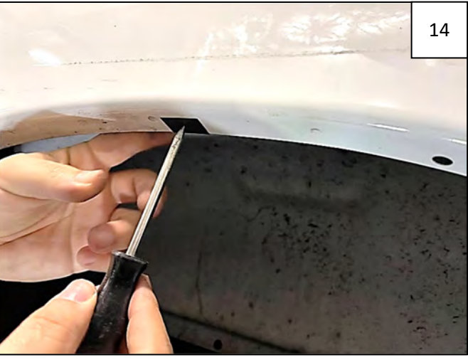
Using an awl, pierce Mounting Tab into the factory hole underneath.