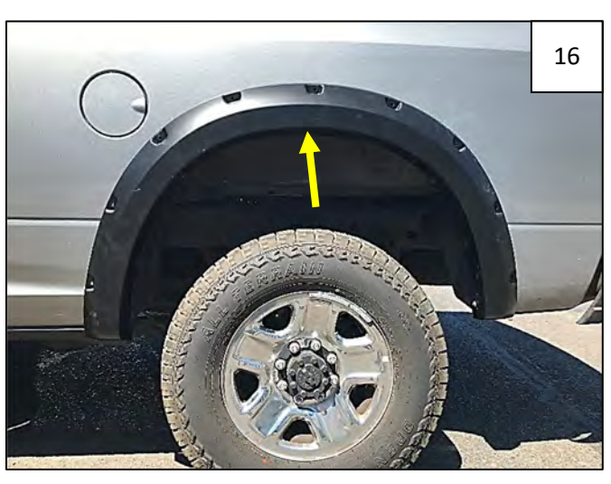
Align flare on fender. Using a Philips screwdriver, start supplied Truss Head Screw through flare and into clip installed in Step 15.