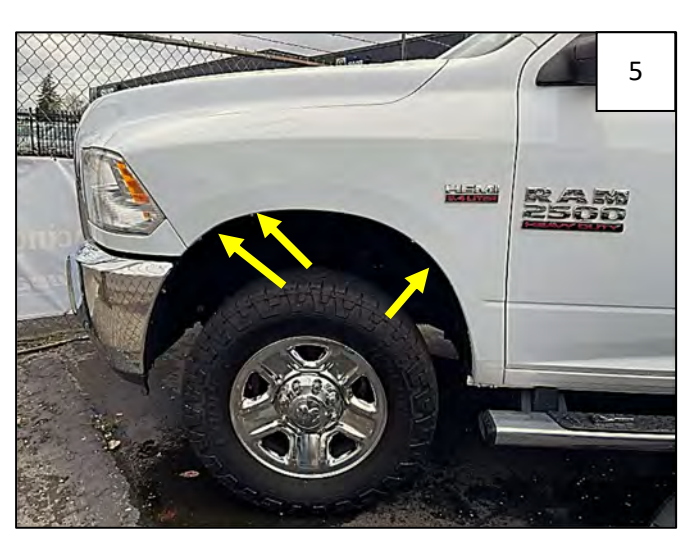
Remove and retain 3 factory screws as shown.