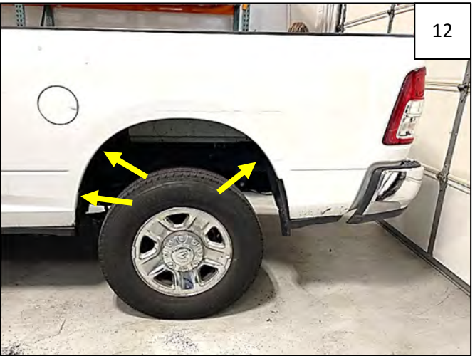
Remove and retain 3 factory screws.