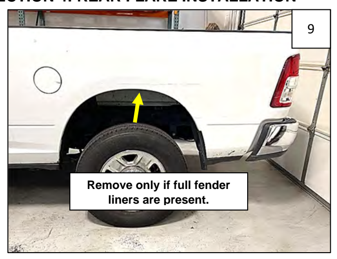
If vehicle is equipped with full fender liners, remove top most factory screw at top of fender; retain for reuse. If vehicle is not equipped with fender liners, proceed to Step 10.