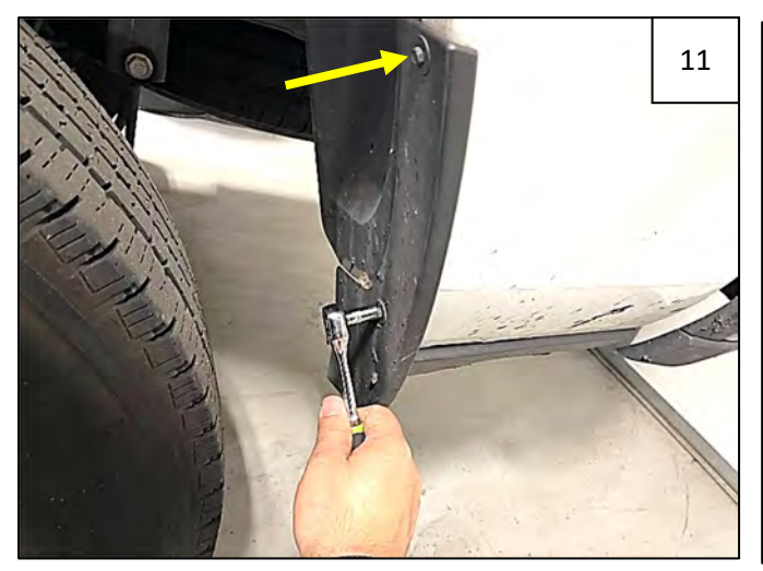
Using an 8mm socket, remove 2 fasteners at rear mudflap. Retain factory screws. Pull until plastic clips release.