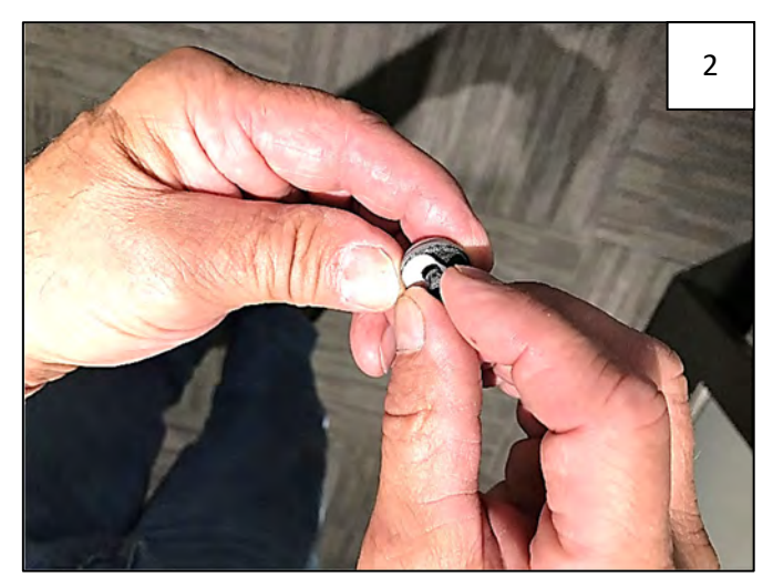
Peel liner from tape on Push-In Pocket Hardware (brushed metal or black as preferred). NOTE: There will be extra Push-In Pocket Hardware.