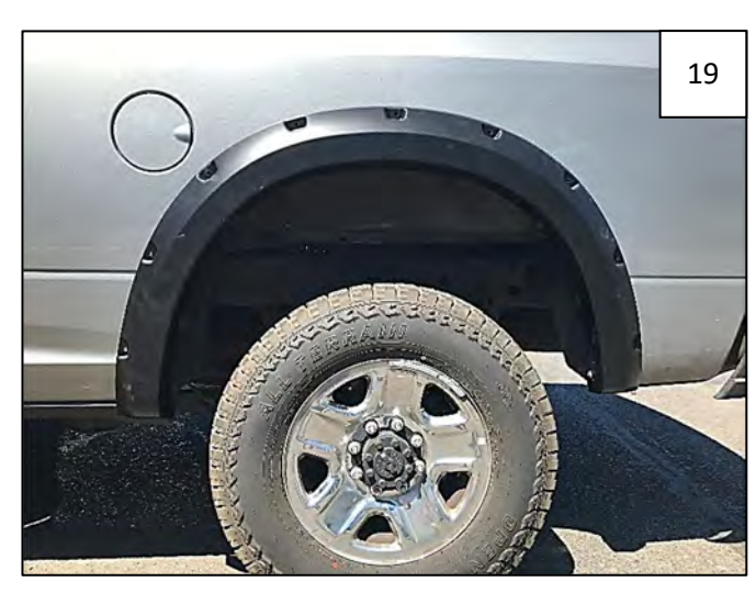
Complete Rear Flare Installation.