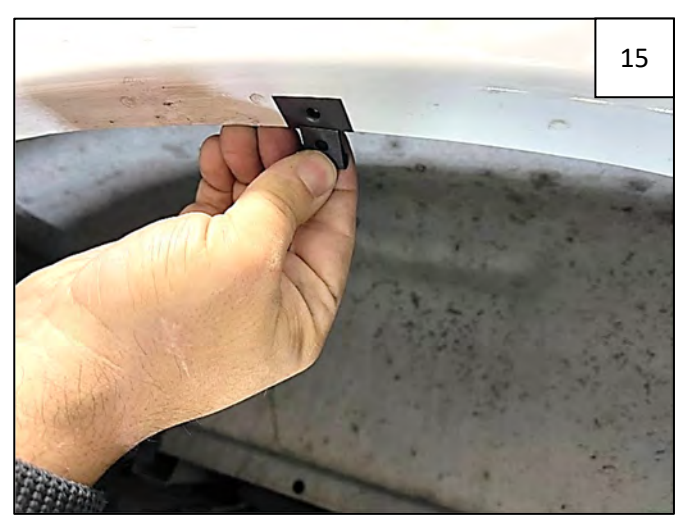
Slide a supplied "U" Clip over the mounting tab centering over the hole made in Step 14.