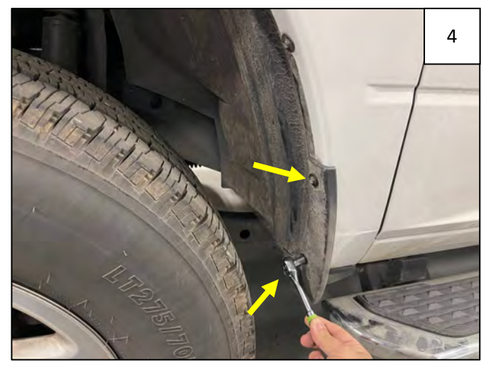
Remove 2 factory screws from mud flap. Fasteners will be reused. Do not remove fastener above mud flap. Pull mud flap towards you to remove – it's held on with 2 hidden plastic clips.