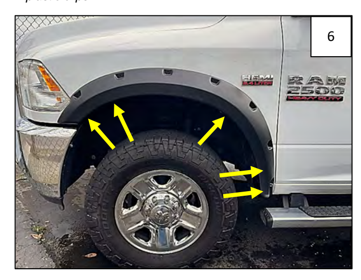
Align flare with vehicle. Start 5 factory screws through holes in flare and into factory holes.