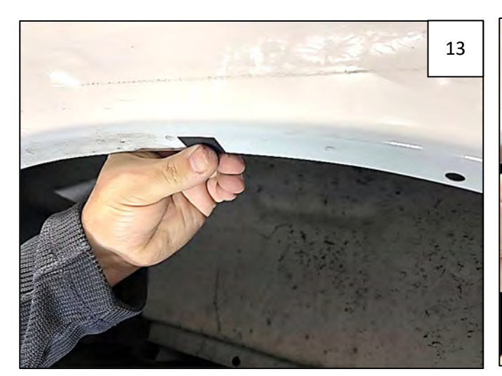
For topmost hole in wheel well, peel liner from a supplied Mounting Tab and center over the factory hole. If vehicle had full wheel well liners, no tab or clip is needed – just reuse factory fastener.