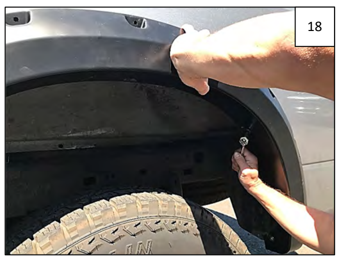
Press inward on flare to apply pressure and tighten all screws.