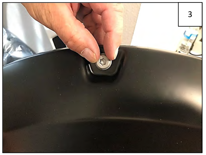
Insert Push-In Pocket Hardware into each flare pocket hole (on outer flare surface, 8 places each front flare, 9 places each rear flare). Push in to engage clip and tape adhesion.