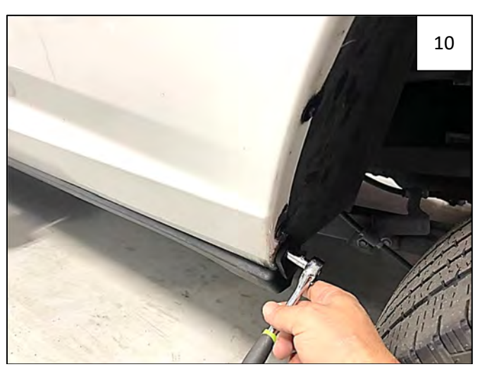
Using an 8mm socket, remove and retain factory screw at front of rear wheel well.