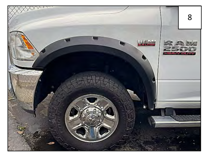
Complete Front Flare Installation.