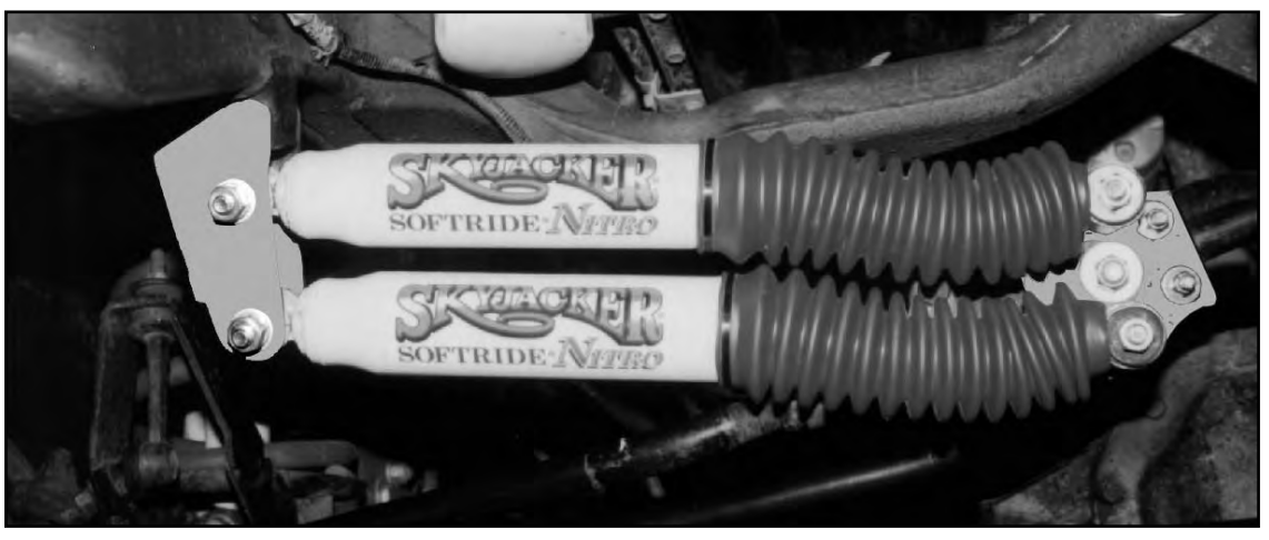
Dual Steering Stabilizer Available, #7217