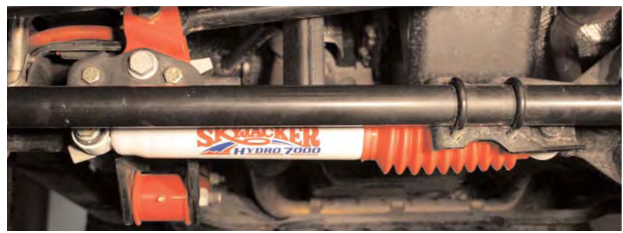
10. Install new Front Skyjacker shocks using hardware supplied. Install tires/wheels.