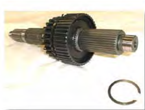
(Fig. 4A) (Large) Retaining Ring Installation