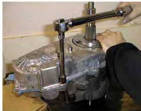
(Fig. 8A) Case Halves Assembled