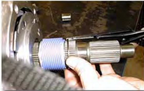
(Fig. 9A) Speed-o- Ring Gear Install