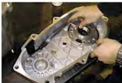
(Fig. 6A) Case Half Pre-assembly