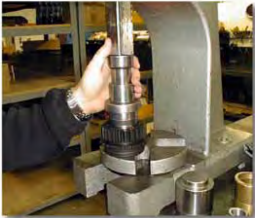
(Fig. 1A) Drive Sprocket Needle Bearing Installation