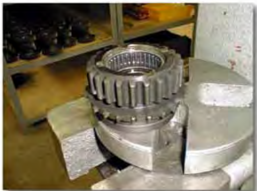
(Fig. 2A) Installed Needle Bearings in Drive Sprocket