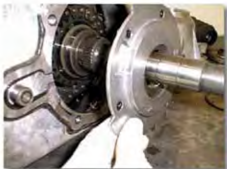
(Fig. 9) Oil Pump Removal