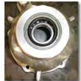
(Fig. 11A) Seal Installed