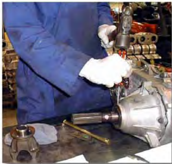
(Fig. 5) Rear Seal Removal