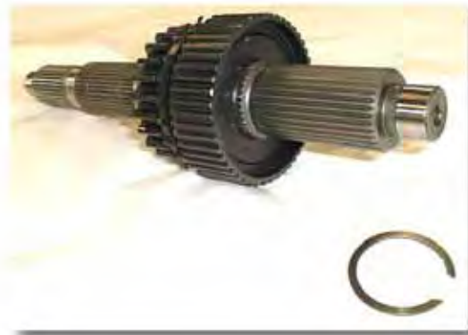
(Fig. 4A) (Large) Retaining Ring Installation