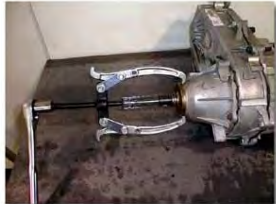
(Fig. 3) Slinger Removed (TJ Illustrated)