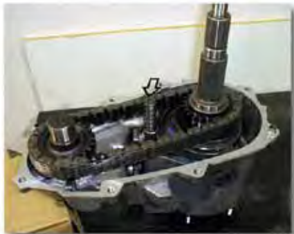
(Fig. 5A) New Main Output Shaft Assembly