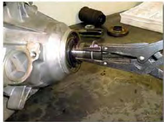
(Fig. 4) Stop Spacer & Snap Ring Removal