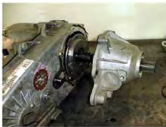
(Fig. 8) Rear Tailhousing Removal