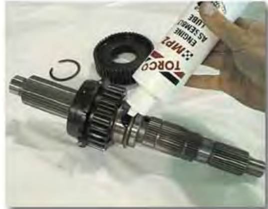
(Fig. 3A) New Main Output Shaft Assembly