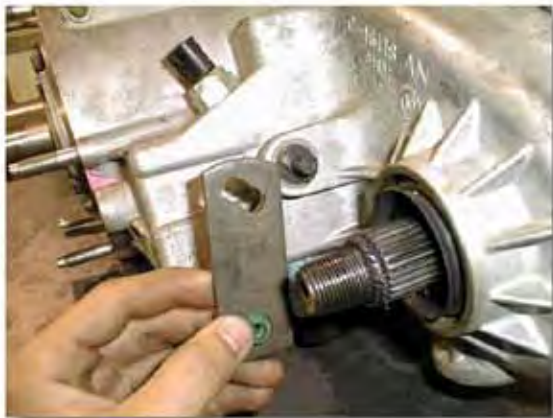
(Fig. 2) Range Selector Removal