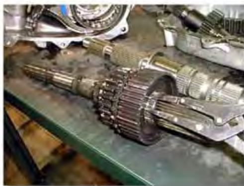
(Fig. 12) Front Drive Chain & Shaft Removal