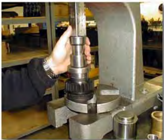
(Fig. 2A) Pull the Needle Bearings Out

These bearings must be removed. Once the bearings are removed, clean the inside of the drive gear to make sure it is free of any type of debris.