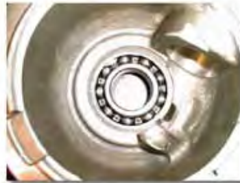
(Fig. 10A) Bearing Installed and Retained with the 716464 Snap Ring

Using a hack saw or cutoff wheel (and safety glasses), trim the shift rail shaft so that it protrudes only 1" (photo above right).