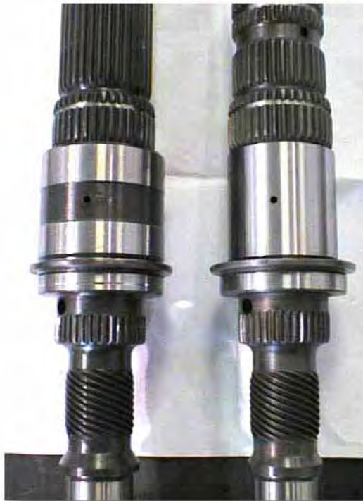
TJ style shaft Current kit design. No needle bearings required. See Page 7 for assembly considerations.

This information is provided to you to verify which style shaft you have so installation is properly performed.