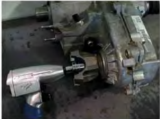
(Fig. 1) Yoke Nut Removal