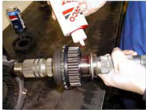
(Fig. 3A) New Main Output Shaft Assembly