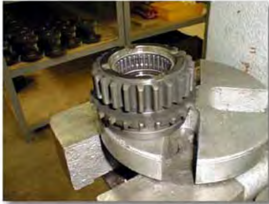
(Fig. 1A) Drive Sprocket Needle Bearings

These bearings must be removed. Once the bearings are removed, clean the inside of the drive gear to make sure it is free of any type of debris.