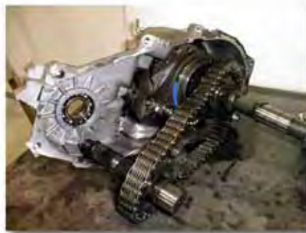
(Fig. 11) Front Drive Chain & Shaft Removal