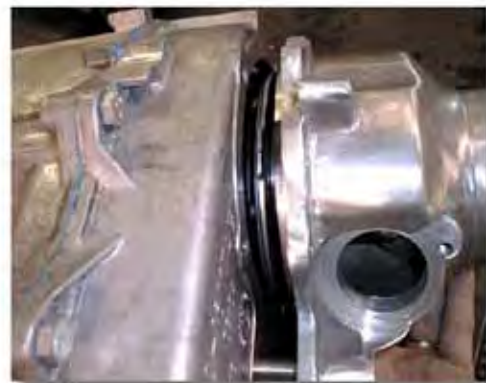
(Fig. 12A) Tailhousing Installation