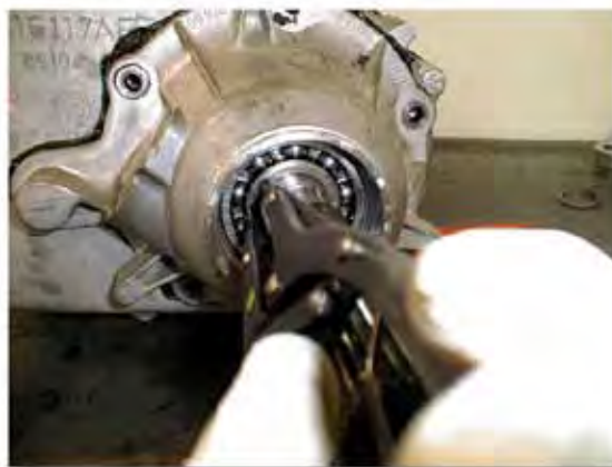
(Fig. 7) Rear I.D. Snap Ring Removal