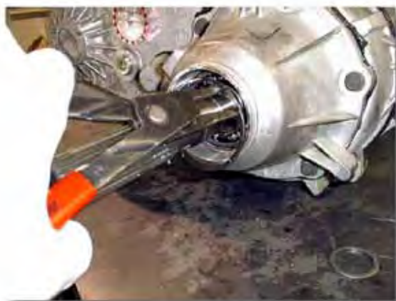
(Fig. 6) Rear O.D. Snap Ring Removal