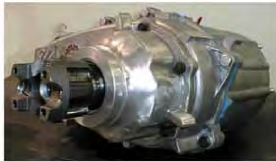
(Figures 13A) Final Installation