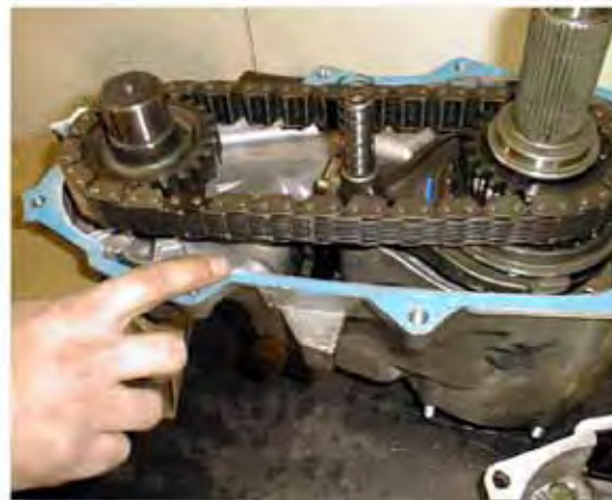
(Fig. 7A) Thin film RTV Applied Prior to Mating Case Halves.