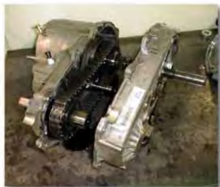
(Fig. 10) Rear Case Half Removal