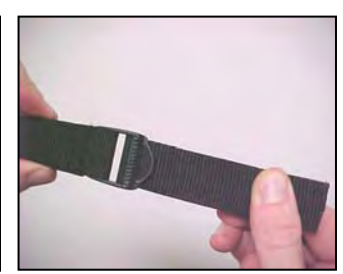
Figure 2 Figure 3