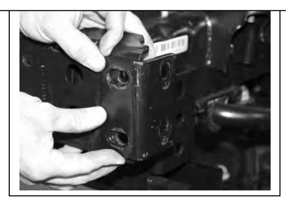
Fig 2 Note the orientation of the bolt holes