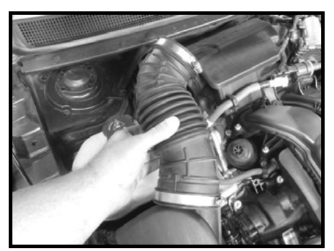
Step 4 Remove the intake hose from the vehicle.