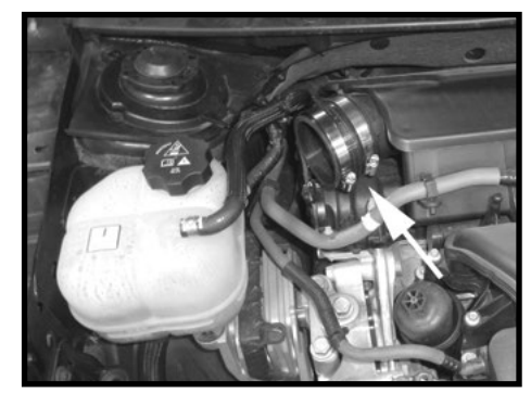
Step 7 Install the provided coupler on to the vehicle as shown.