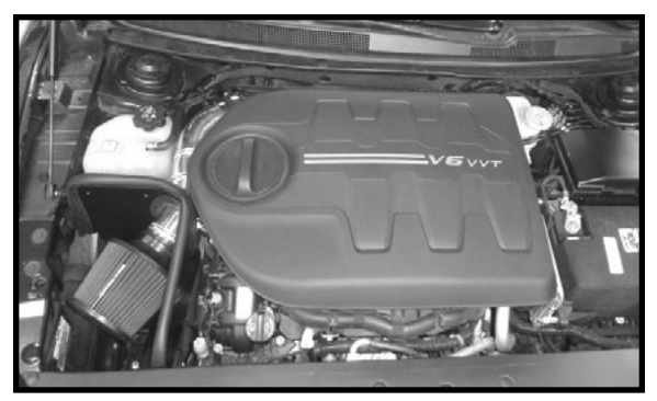
Make sure that all clamps and hardware are fully tightened. Reconnect the battery cable, start the vehicle and let it warm up. Shut off and inspect the installation once more for any loose clamps, wires, or hardware. Test drive & enjoy! Your installation is now complete. Periodically check all clamps and brackets.