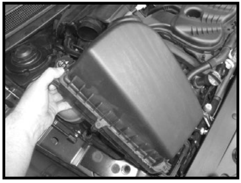
Step 5 Lift up to release the mounting studs holding the air box and lift the air box out of the vehicle.