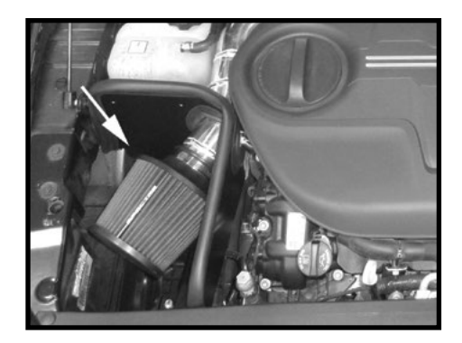
Step 9 Install the filter onto the Intake tube and tighten the hose clamp. Reinstall the engine cover.