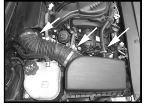
Step 3 Disconnect the quick disconnect hose at the air box. Loosen the hose clamps that hold the air intake in place. Then release the plastic clip that holds the coolant hose onto the intake tube.