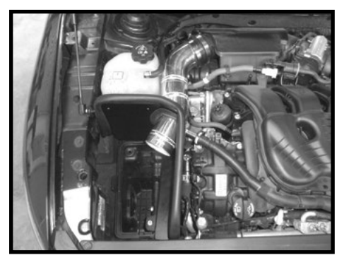
Step 8 Install the intake tube into the hole in the heat shield. Install the intake assembly into the vehicle as shown while making sure the plastic mounts capture into the locating grommets.