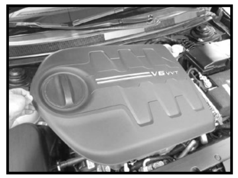
Step 2 Lift the engine cover up to release the clips holding it in place and remove the engine cover from the vehicle.

Safety first! Before you begin the installation, make sure that the vehicle is in park (or neutral for a manual transmission) with the parking brake set. Disconnect the negative battery terminal and verify that all components that are listed are present. Note: This kit was designed and tested on a stock engine without any custom tuning done to the engine computer. Removing the battery cable may erase the programmed radio stations. The anti-theft code will need to be entered into some radios after the battery cable is connected. The anti-theft code can typically be found in the owner's manual or at your local dealership.