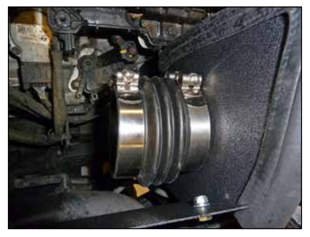
16. Install the provided flex coupler onto the filter adapter and secure with the provided hose clamp.