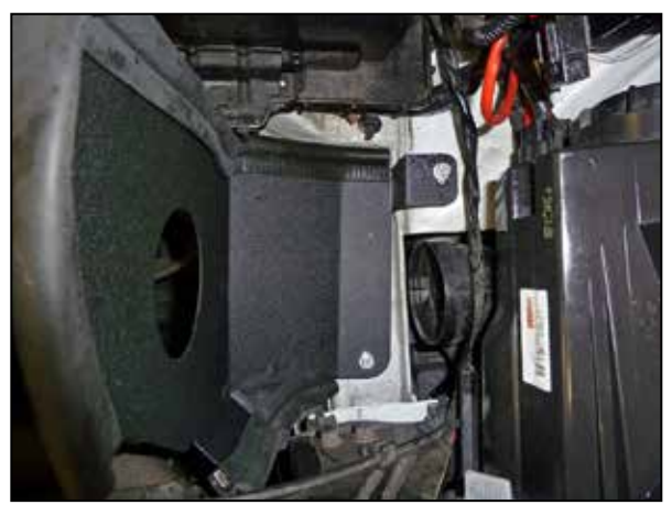
11. Set the heat shield into position on the rubber mounted studs and secure with the provided hardware.