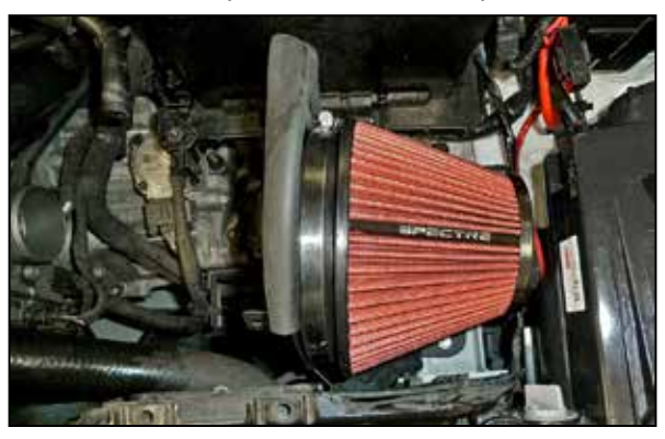
13. Install the filter assembly into the heat shield and secure with the rear mounting bolt provided only at this time.