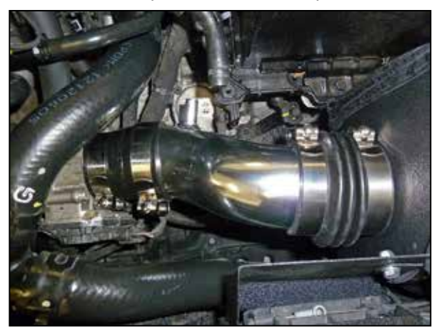
17. Install the intake tube into the coupler hose at the throttle body fully then into the coupler hose at the filter adapter, adjust the tube for proper fit and then secure with the provided hose clamps.