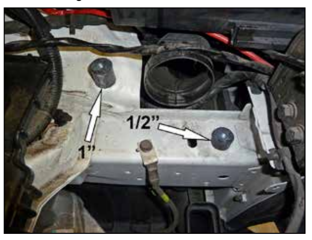
10. Install the 1" rubber mounted stud into the rear factory air box mounting location as shown. Install the ½" rubber mounted stud into the front factory air box mounting location as shown.