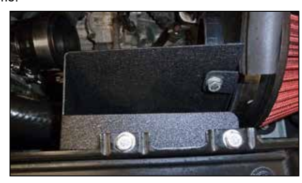
14. Install the fresh air intake scoop and secure to the core support and heat shield/filter adapter with the provided hardware.