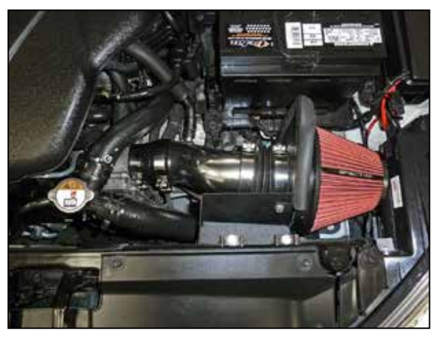
19. Make sure that all clamps and hardware are fully tightened. Reconnect the battery cable, start the vehicle and let it warm up. Shut off and inspect the installation once more for any loose clamps, wires, or hardware. Test drive & enjoy! Your installation is now complete. Periodically check all clamps and brackets.

If you need any assistance please call 1-800-858-3333 to speak with a representative in our Customer Service Center before returning the product.