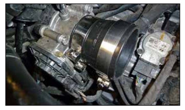
15. Install the provided silicone step coupler onto the throttle body and secure with the provided hose clamp.