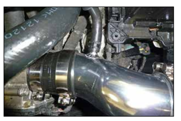
18. Reroute the crank case vent line under the fuel line and then install it onto the crank case vent fitting on the intake tube.