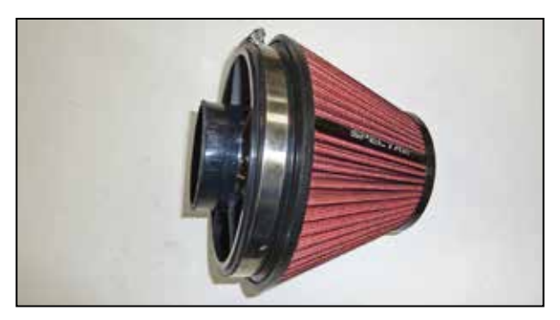
12. Install the filter adapter into the SPECTRE® air filter and secure with the provided hose clamp.