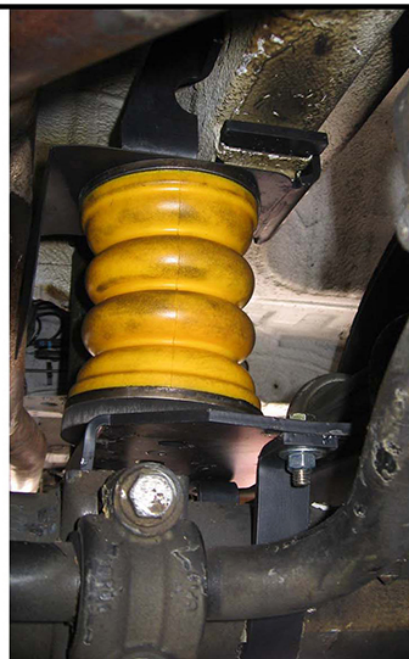
Passenger's side unloaded