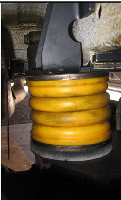
Passenger's side loaded