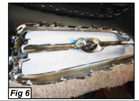
Thank you for purchasing a T-REX Grille 11/3/09