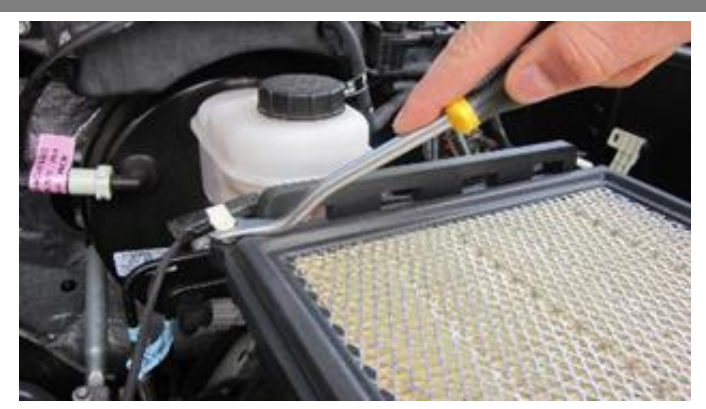
5. Remove the two plastic wire retention clips from back of factory air box