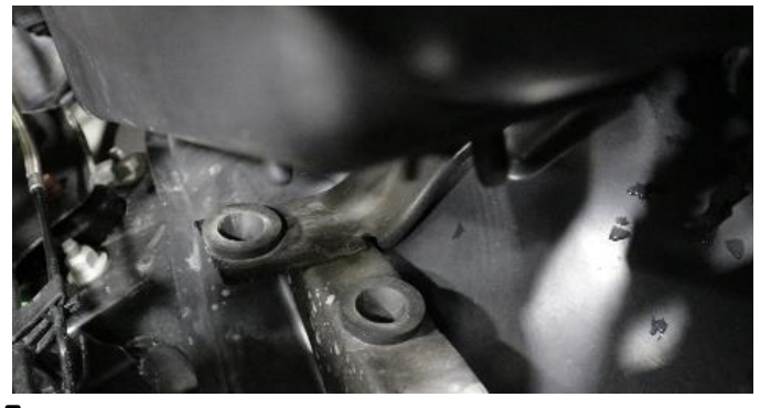
Install Volant air box into the vehicle by inserting stems on bottom of Volant air box into factory grommets.