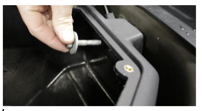
4. Attach the Volant air box to the fender with the bolt from Removal Step 4 using a ratchet and 13mm socket.