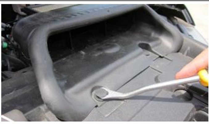
6. Remove the two plastic clips from the factory air scoop. Save clips for Install Step 5 .