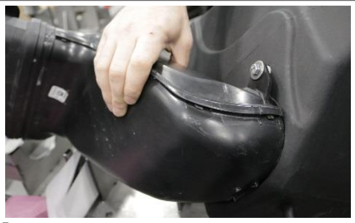
Install factory scoop to Volant air box using provided 6mm-25 bolt with flat washers, lock washer, spacer, and nut using 10mm socket or wrench..