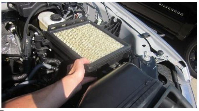
Remove the bottom box assembly by pulling it up and out. Remove the rubber grommet and metal bushing from factory air box. Save for Install Step 1.