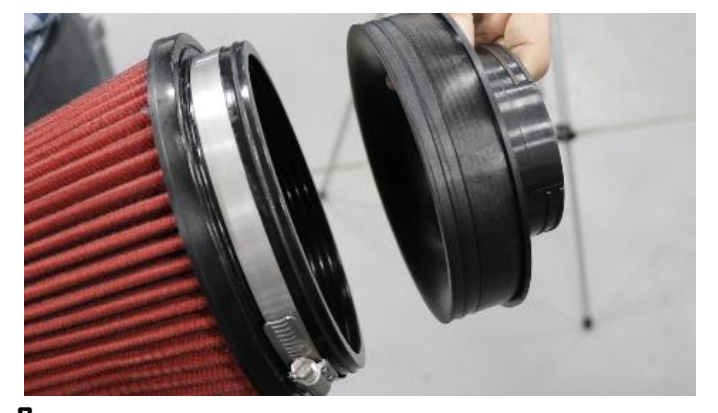
6. Place the filter clamp on the filter and insert the filter adapter as shown. Do not tighten clamp yet.