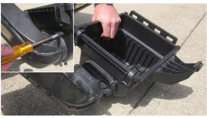
8. Remove the bolt attaching the scoop to factory air box using an 8mm socket. Remove the factory air scoop from the bottom of the air box.