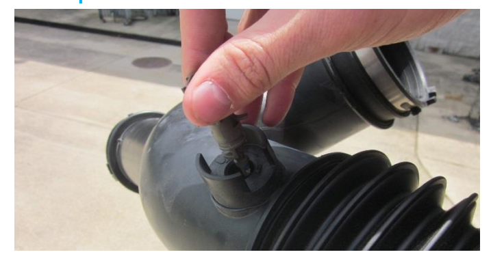
9. Remove the air temp sensor from factory duct. Save for Install Step 9.