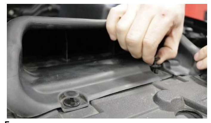
5. Reinstall factory scoop and attach with clips from Removal Step 6.