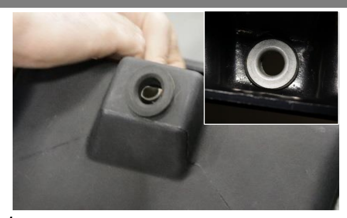
1. Insert the factory grommet from Removal Step 7, then install the metal bushing into grommet from inside box as shown.