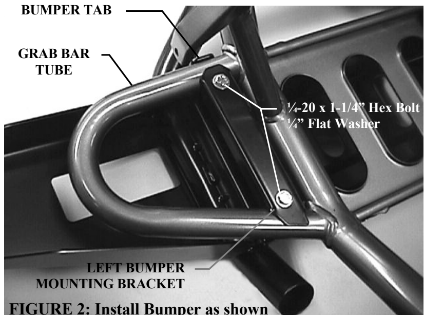
FIGURE 2: Install Bumper as shown

See Light Installation instructions, if equipped, to complete installation.